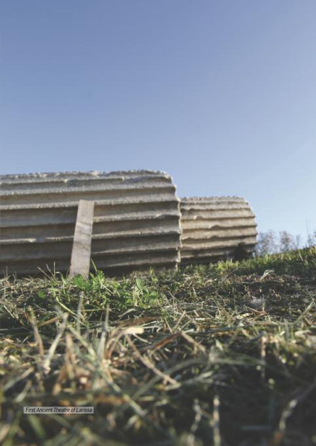
First Ancient Theatre of Larissa