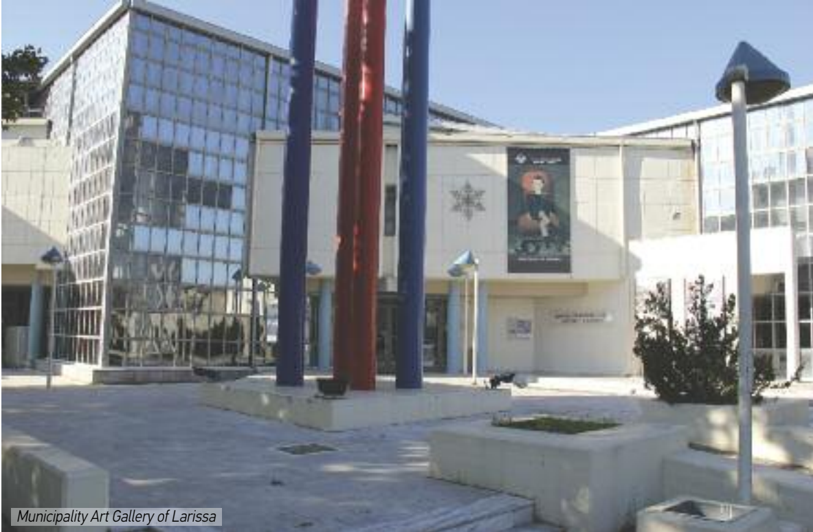
Municipality Art Gallery of Larissa