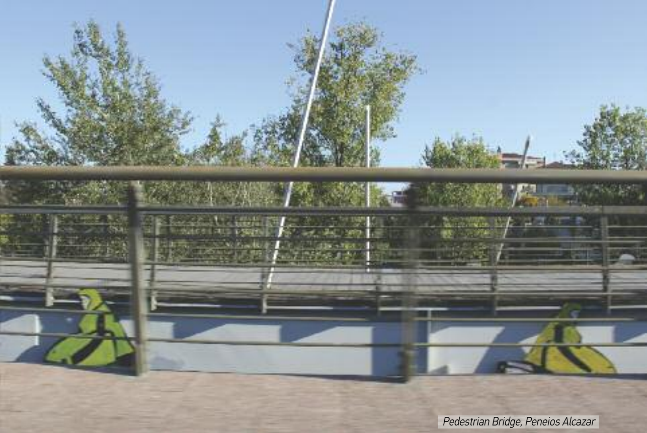
Pedestrian Bridge, Peneios Alcazar