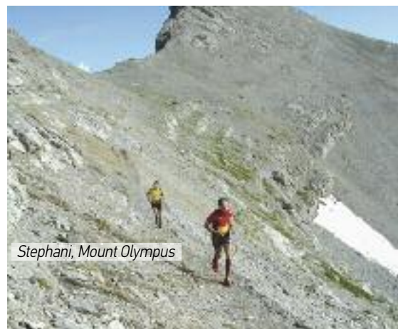
Stephani, Mount Olympus

> In this educational programme, students, via collaborative and interactive methods will become acquainted with the Olympus ecosystems; they will come closer to its myth and will become aware of the imminent dangers of human intervention. More specifically, groups of students through visits to places of remarkable natural beauty, will see, investigate, analyze and study the biotic and abiotic factors that make up the mountain environment. The students will come closer to the cultural content of the mountain with visits to the archaeological sites of the Perrai-vikis Tripolitida and the traditional settlements near the mountain. Each group will investigate and identify the human interventions such as road networks, settlements, irrigation, logging, grazing, tourist facilities, and fire damages.