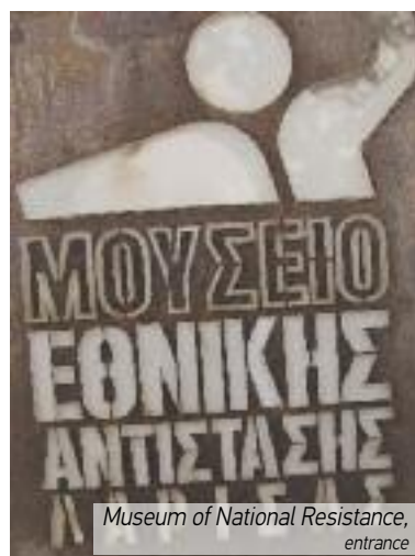
Museum of National Resistance, entrance

> The second and most important gallery in the country was founded in 1983 and operates in a modern building since 2003. Part of the G.I. Plastiras collection is exhibited there – 150 artworks of the 19th and 20th century as well as Heinrich Schliemann's furniture. Important personal and group exhibitions take place in its grand showrooms as well as some exhibitions in collaboration with other museums, galleries and institutions.