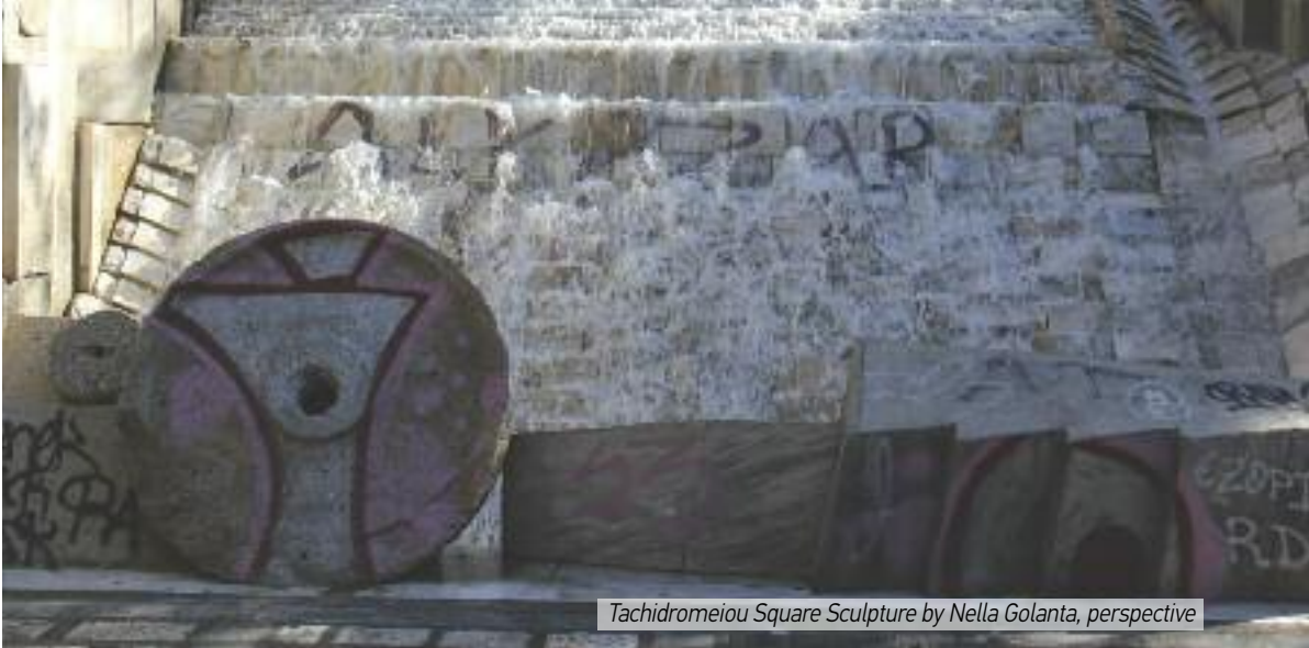
Tachidromeiou Square Sculpture by Nella Golanta, perspective