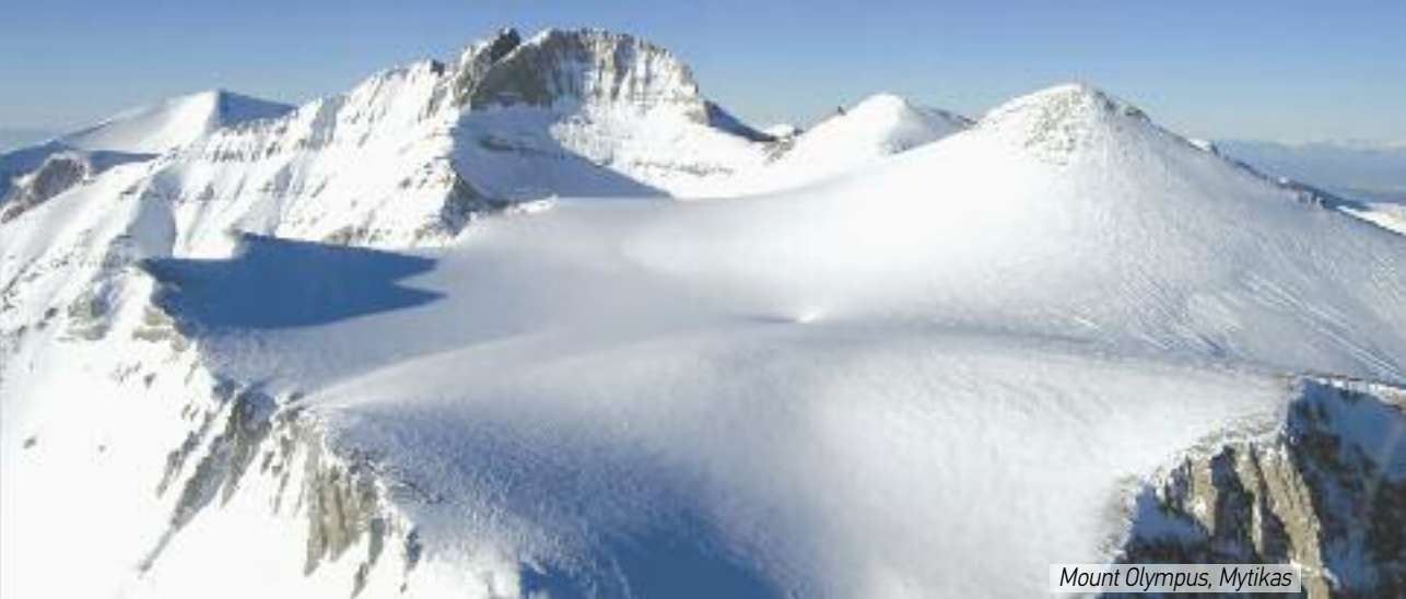
Mount Olympus, Mytikas