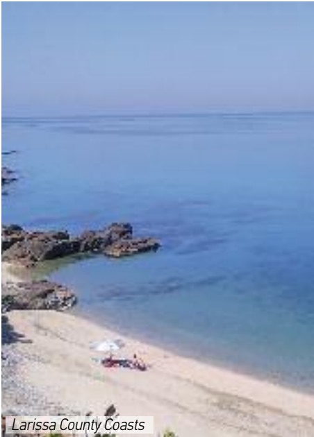
Larissa County Coasts