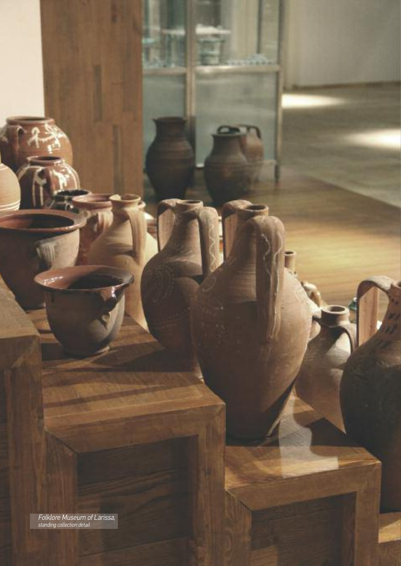
Folklore Museum of Larissa, standing collection detail