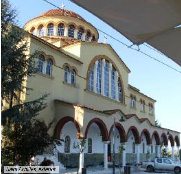
Saint Achilles, exterior

> You should not miss visiting the Grove of Larissa, a relaxation and recreation area, a lung of green at the banks of Peneios River, near the city exit to Tyrnavos. There you will find a playground, a mini golf, a cafeteria as well as walking paths and bike trails.