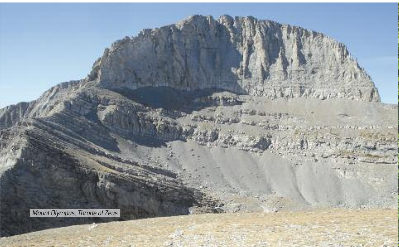
Mount Olympus, Throne of Zeus

1.00pm-2.00pm Assessment – end of excursion