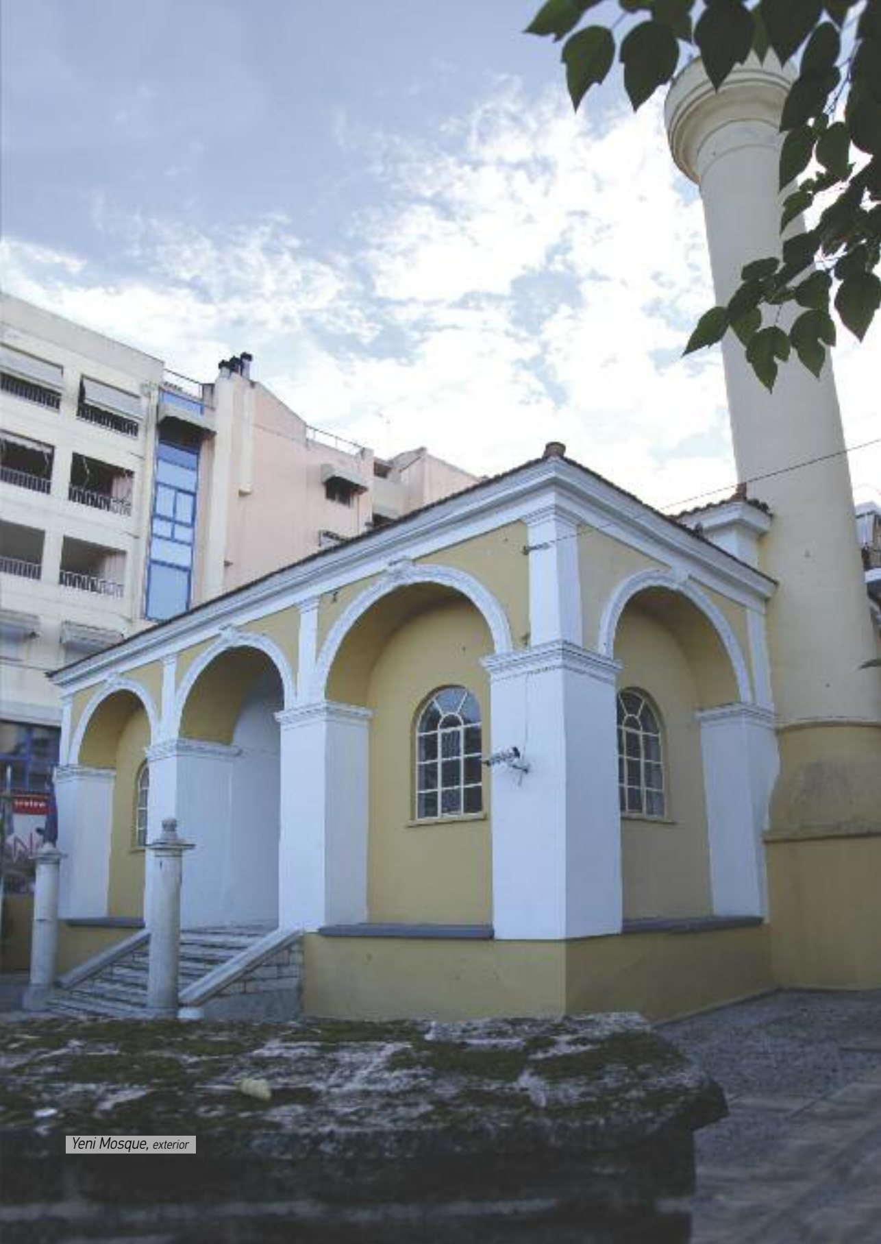
Yeni Mosque, exterior