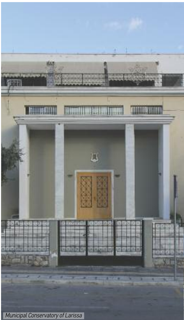
Municipal Conservatory of Larissa

> In a 5-minute walking distance from the Central Square, it flows beneath the Saint Achilles Bridge on the inner branch of Peneios River. Enjoy the waterside walkways, the cycle paths, and the pedestrian bridges, away from the busy city center, yet so close. Directly related to the long history of the city, Peneios River is affiliated with athletic and cultural events, being next to the Alcazar Park and the Kipothentro, as well as other recreational areas.