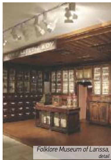
Folklore Museum of Larissa, detail

> The museum hosts an exhibition that presents us with the modern Hellenic civilization and particularly the one of the Thessaly from the 16th century to the mid 20st. The museum presents the pre-industrial civilization in the rural Thessaly, as well as the urban life of Larissa. It aims at promoting and preserving the folk culture of Thessaly.