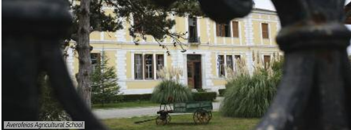
Averofeios Agricultural School