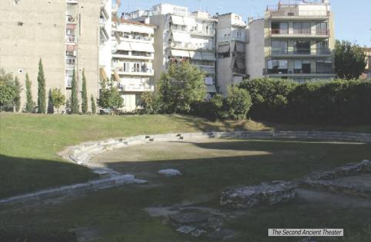
The Second Ancient Theater