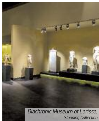
Diachronic Museum of Larissa, Standing Collection

> The new Museum of Larissa, of a showroom of 1,500 sq.m., in a 54 acres area in Mezourlo, includes characteristic samples of the Thessalian culture from the Paleolithic and Neolithic era, the Iron and Bronze Age, the Archaic, the Classical, the Hellenistic, the Roman, the Early Christian, the Byzantine to the Ottoman period and the 19th century. Unique figurines and pottery from the prehistoric settlements of Thessaly, ancient sculptures and funerary offerings as well as mosaics are among the exhibits.