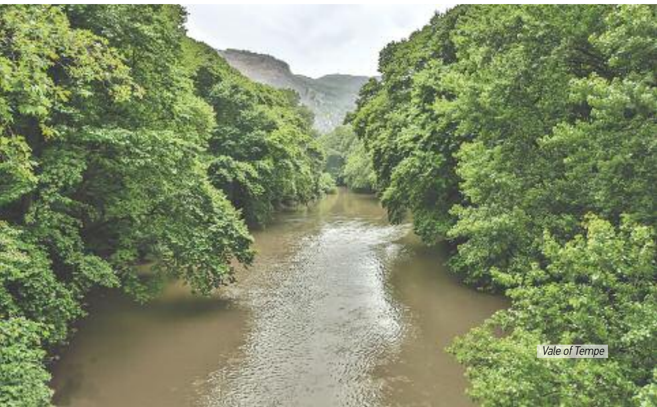
Vale of Tempe

> Vale of Tempe is a valley of exceptional beauty between Olympus and Kissavos Mountains. It is the main crossing point from Macedonia to Thessaly and that is why the area was of great importance during ancient times. The Vale is 10 kilometers long, while at its narrowest point a gorge of 25 meter width and 500 meters height is formed. Peneios River flows through it and empties in the Aegean Sea to create a delta of great biodiversity and ecological value.